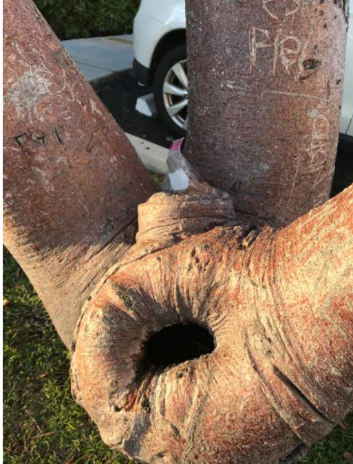
Fig. 3: Rainwater (and potentially mosquito larvae) pool in this gumbo limbo, tree #34 at the south end of Walgreens.