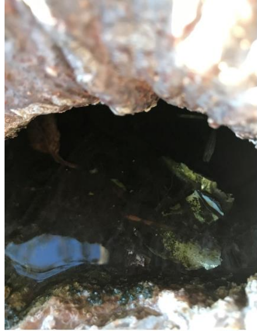
Fig. 4: Close-up of the same cavity. See blue sky reflected in the water.