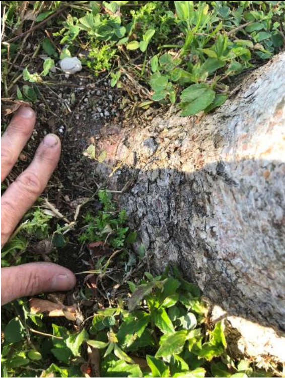
Fig. 1: An important measure for tree's condition is whether trunk flare / root collar is visible. If buried too deep from the outset, or from silt and debris over time, the tree's health can be compromised. In this photo (#9, Gumbo limbo) the trunk flare is visible, though not optimal.