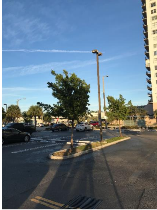
Fig 5: Various trees visible in front lot, including this green buttonwood (#30) in the same spot where the bee swarm had been (in a Brazillian beautyleaf) in 2013. Note the HEAVY presence of persistent jet trails in the sky. The day of the tree evaluation, 1/25/20, it was a clear blue sky all afternoon, but after nearly 40 passes from jets leaving persistent plumes (I also took photos and videos of jets at the same time and altitude that left either a) Contrails – short duration condensation trails that dissipated within seconds) or b) no trail at all.) By the late afternoon a haze like a funeral pall had changed the bright sunshine into a haze. Regardless of the source of these persistent jet trails or their chemical composition, they are indeed changing the amount of light that these trees and ecosystems are getting, and it may be that heat that would otherwise escape to the colder areas beyond the ecosphere, is being trapped by artificially formed “clouds” that formed out of jet trail plumes.