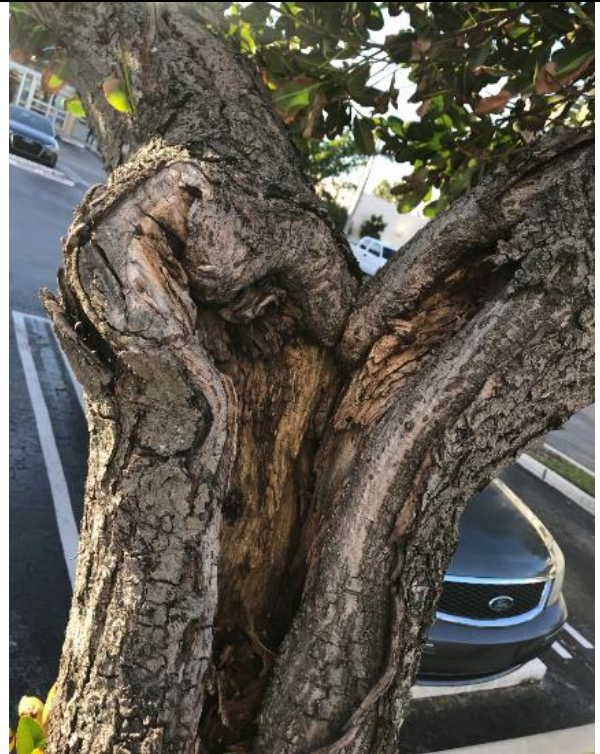
Fig. 2: Calophyllum antillanum / Brazilian beautyleaf, tree #28, was noted as "high risk" because the decay is on the order of 80% of the cross-section at head height, and the tree is in a sensitive place with ample "targets" upon which it could fail, with risk to life and property.