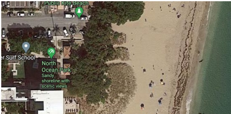
Exhibit A Scope of Authorization Living Water Surf School LLC