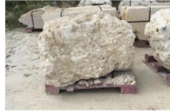
Masonry wall, Keystone natural finish