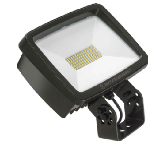
TFX2 with Yoke Mount