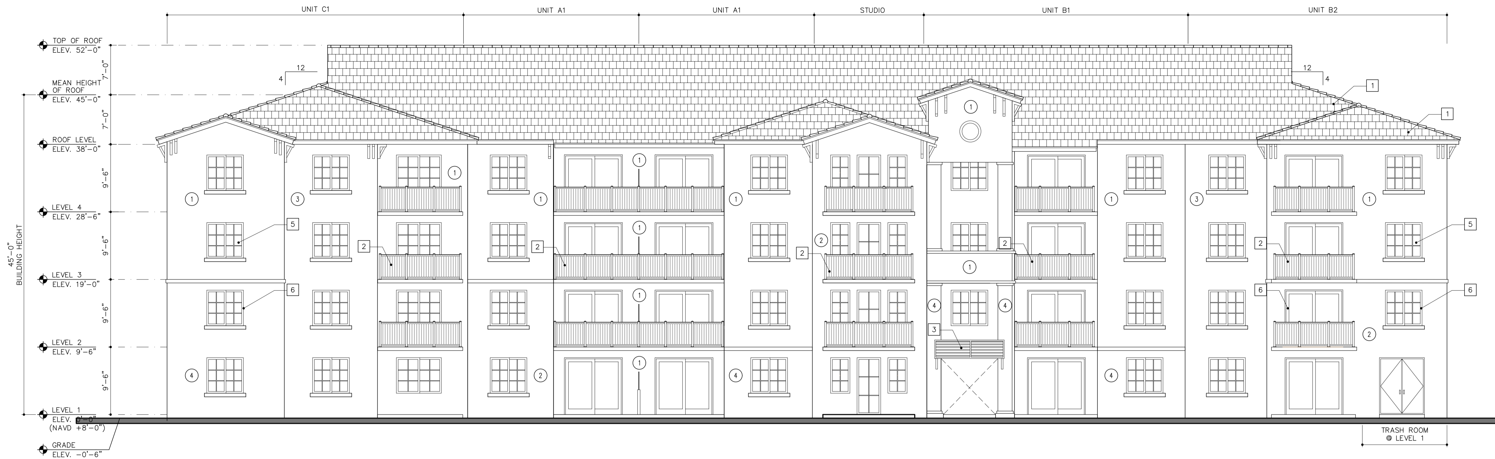
1 FRONT ELEVATION (EAST ELEVATION)