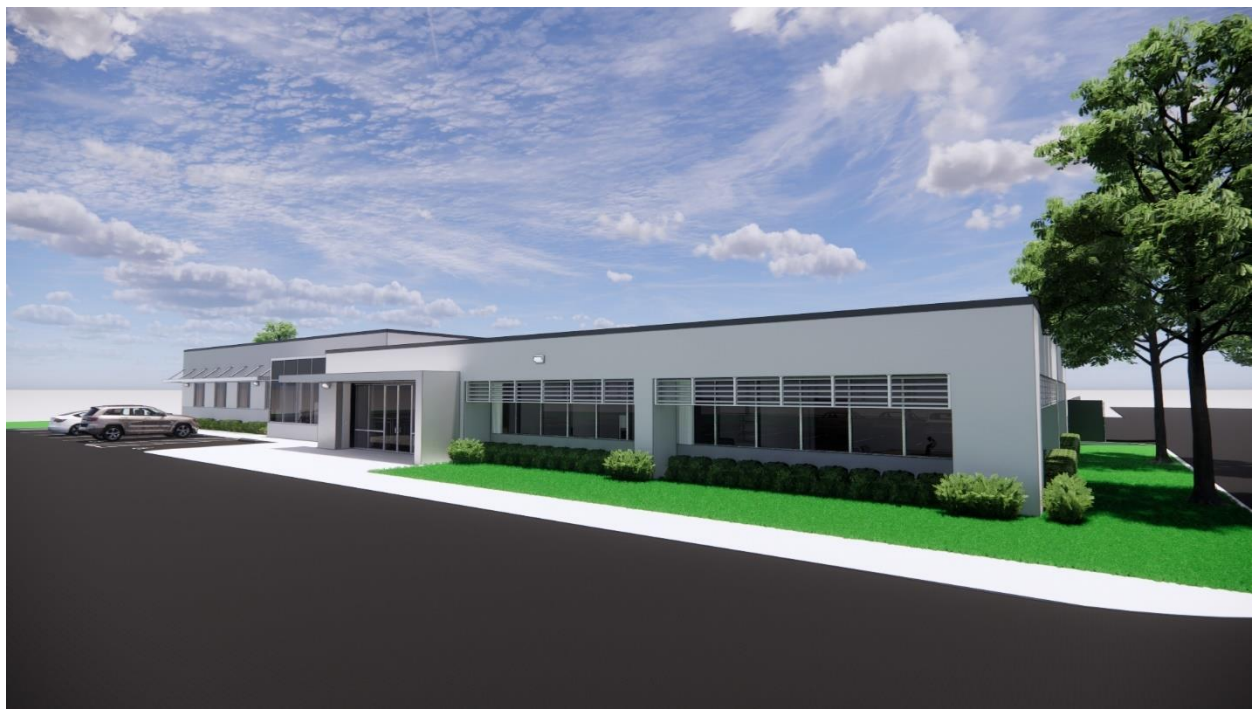
Exterior Project Rendering #1 @ Southwest Street View