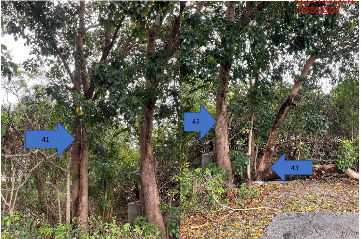
Bishopwood trees ( Bischofia javanica ), facing north. Note all trees are Florida Invasive Species Council Category I Invasives.