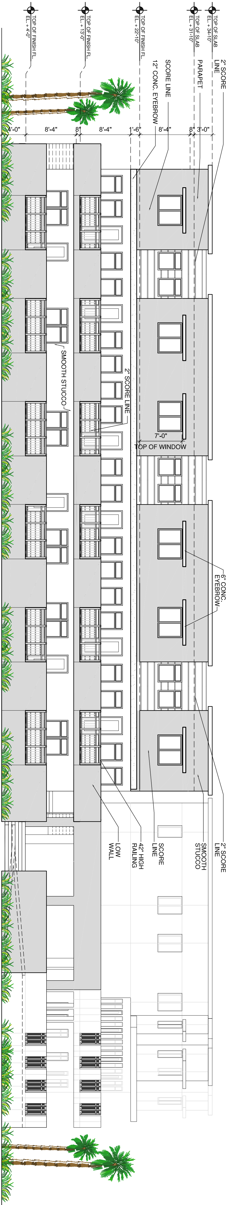
WEST ELEVATION SCALE: 1/8" = 1'-0"