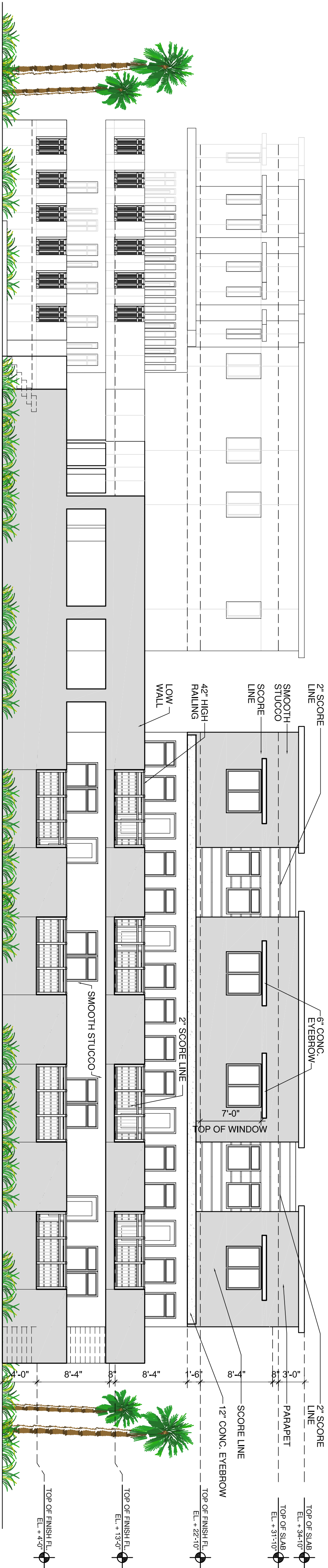
SOUTH ELEVATION SCALE: 1/8" = 1'-0"