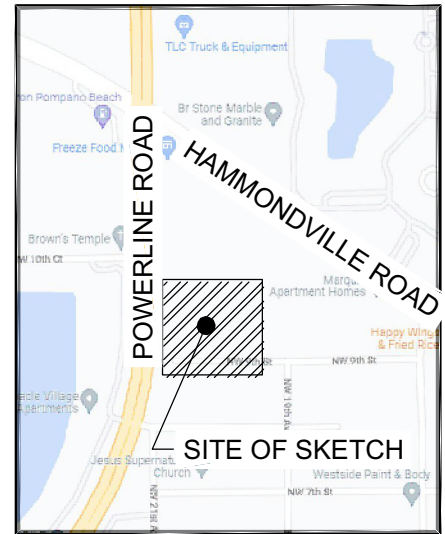
LOCATION MAP: NOT TO SCALE