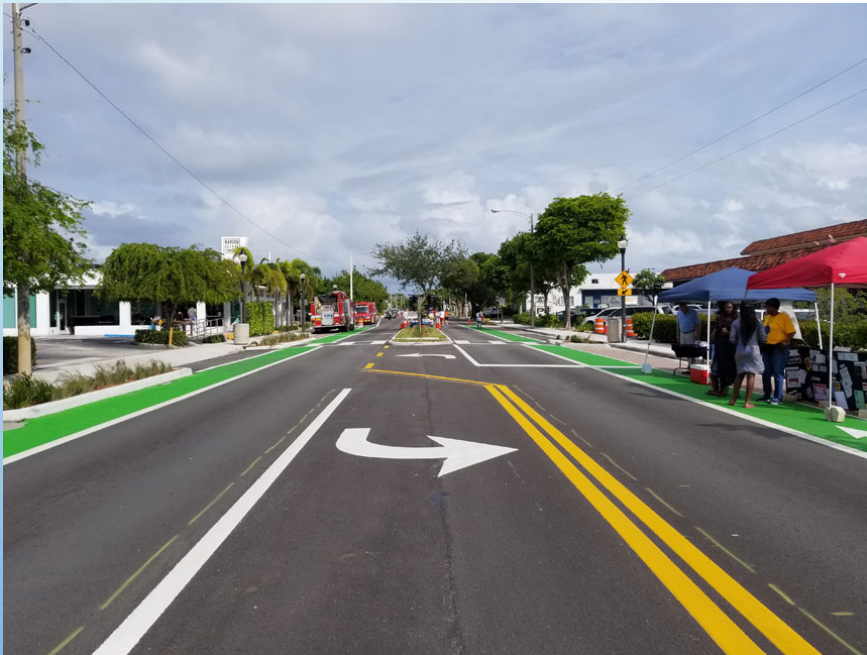
NE 13 th Street Complete Streets