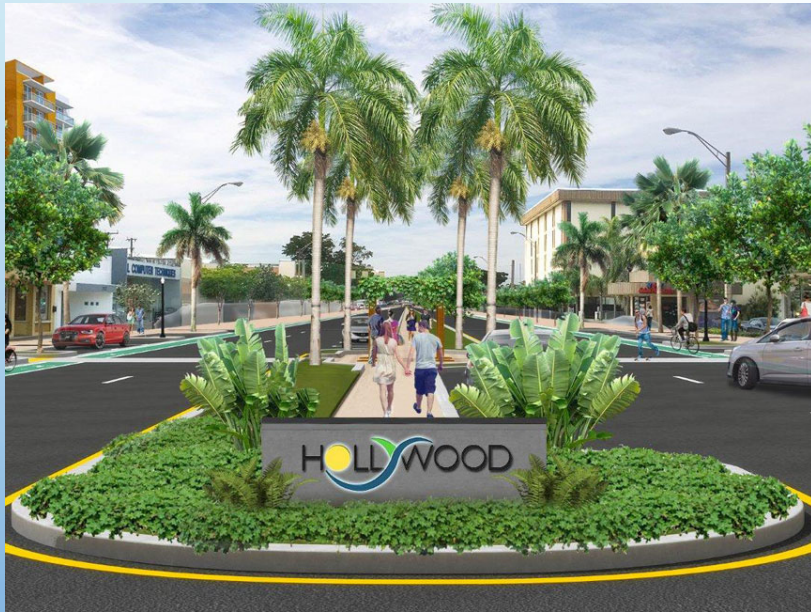
Hollywood Boulevard Streetscape Improvements