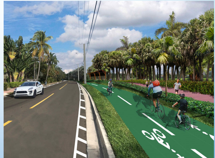
Chase Avenue – W 34 Street Shared Used Path