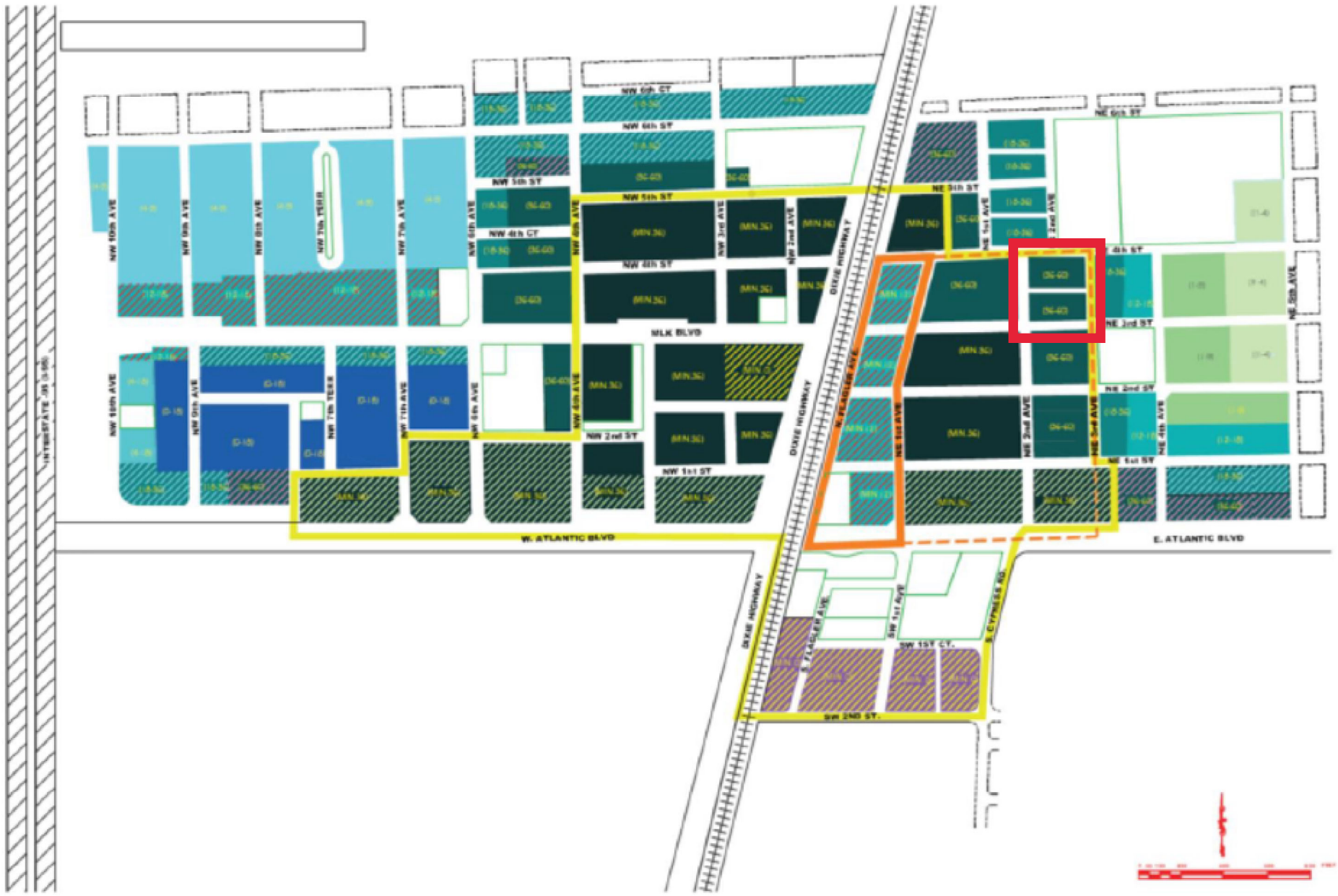
Exhibit: Existing DPOD Density Regulating Plan, subject parcels in red box