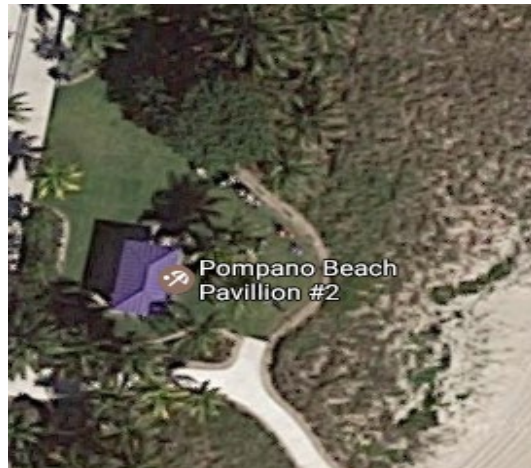
Exhibit A Scope of Authorization Hola Mundo!, LLC