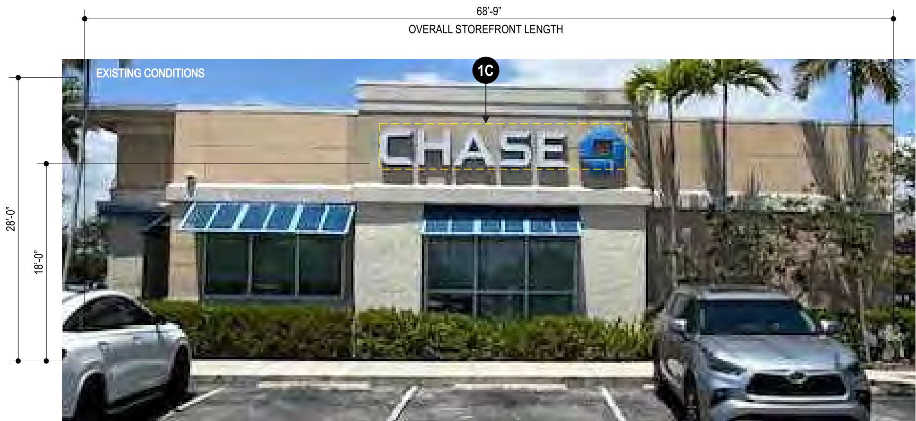
1D EAST EXTERIOR ELEVATION SCALE: 1/8" = 1'-0"