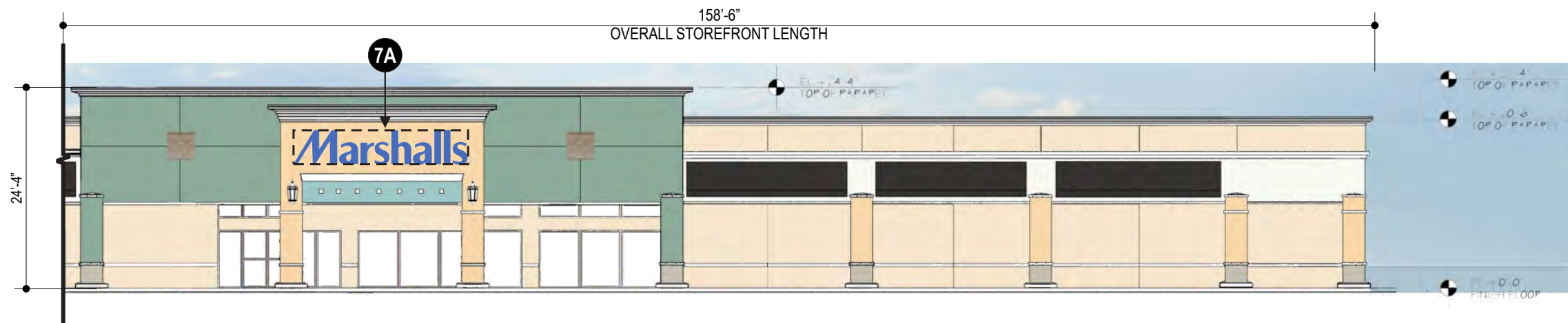
7A SOUTH EXTERIOR ELEVATION SCALE: 1/16" = 1'-0"