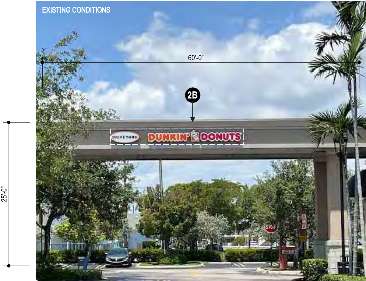
2B EAST EXTERIOR ELEVATION SCALE: 3/32" = 1'-0"