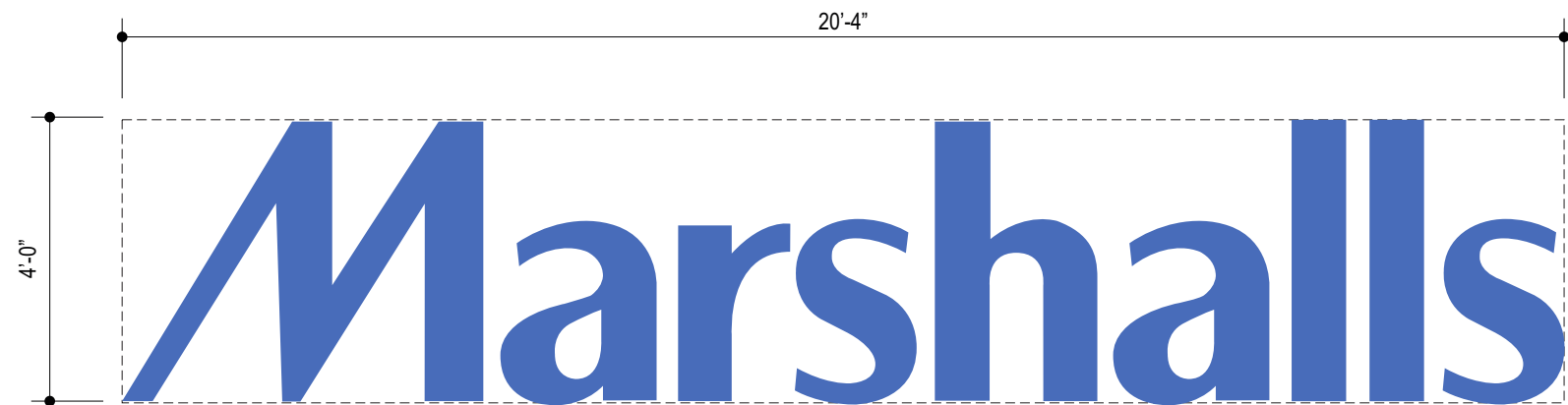
7A SOUTH EXTERIOR ELEVATION SCALE: 1/2" = 1'-0"