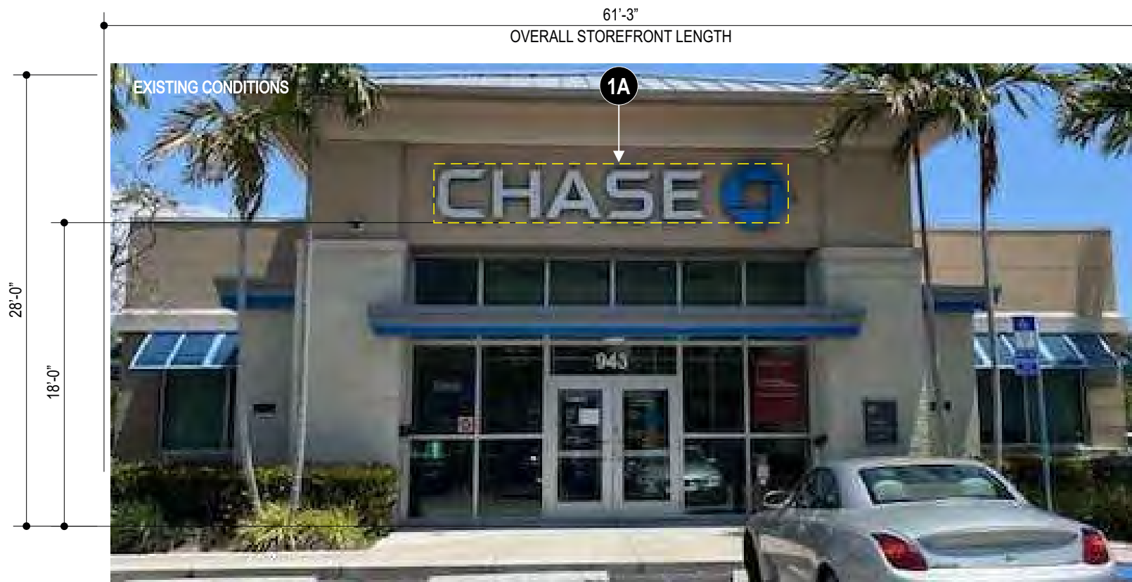
1A SOUTH EXTERIOR ELEVATION SCALE: 1/8" = 1'-0"