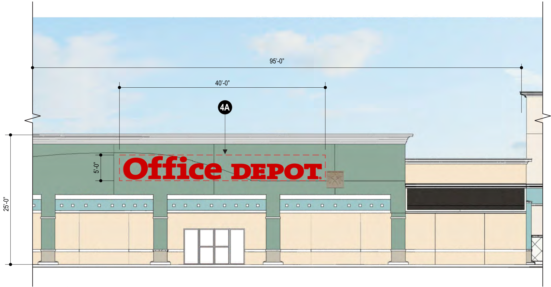
4A SOUTH EXTERIOR ELEVATION SCALE: 3/32" = 1'-0"