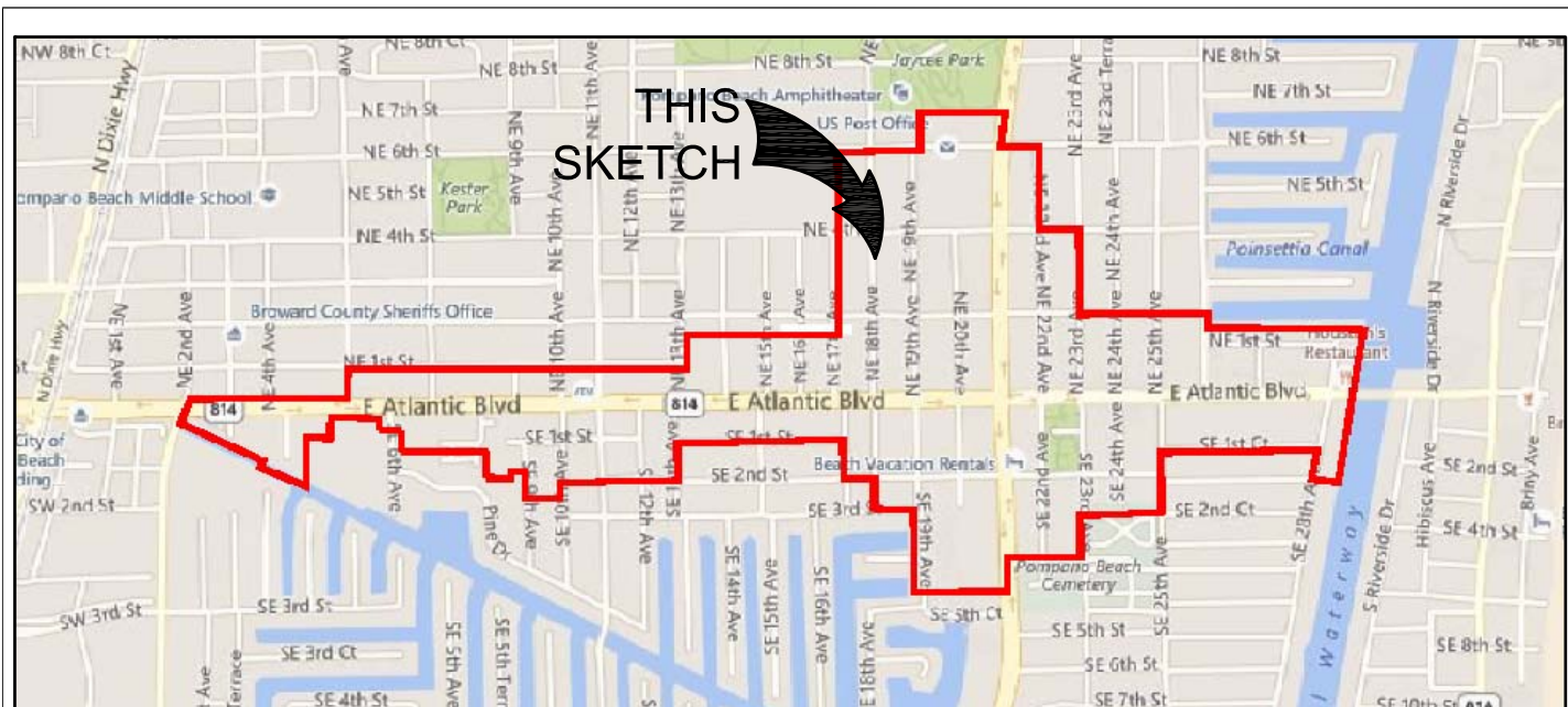
LOCATION MAP: NOT TO SCALE