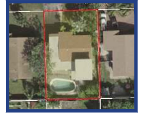
AERIAL PHOTOGRAPH (NOT-TO-SCALE)