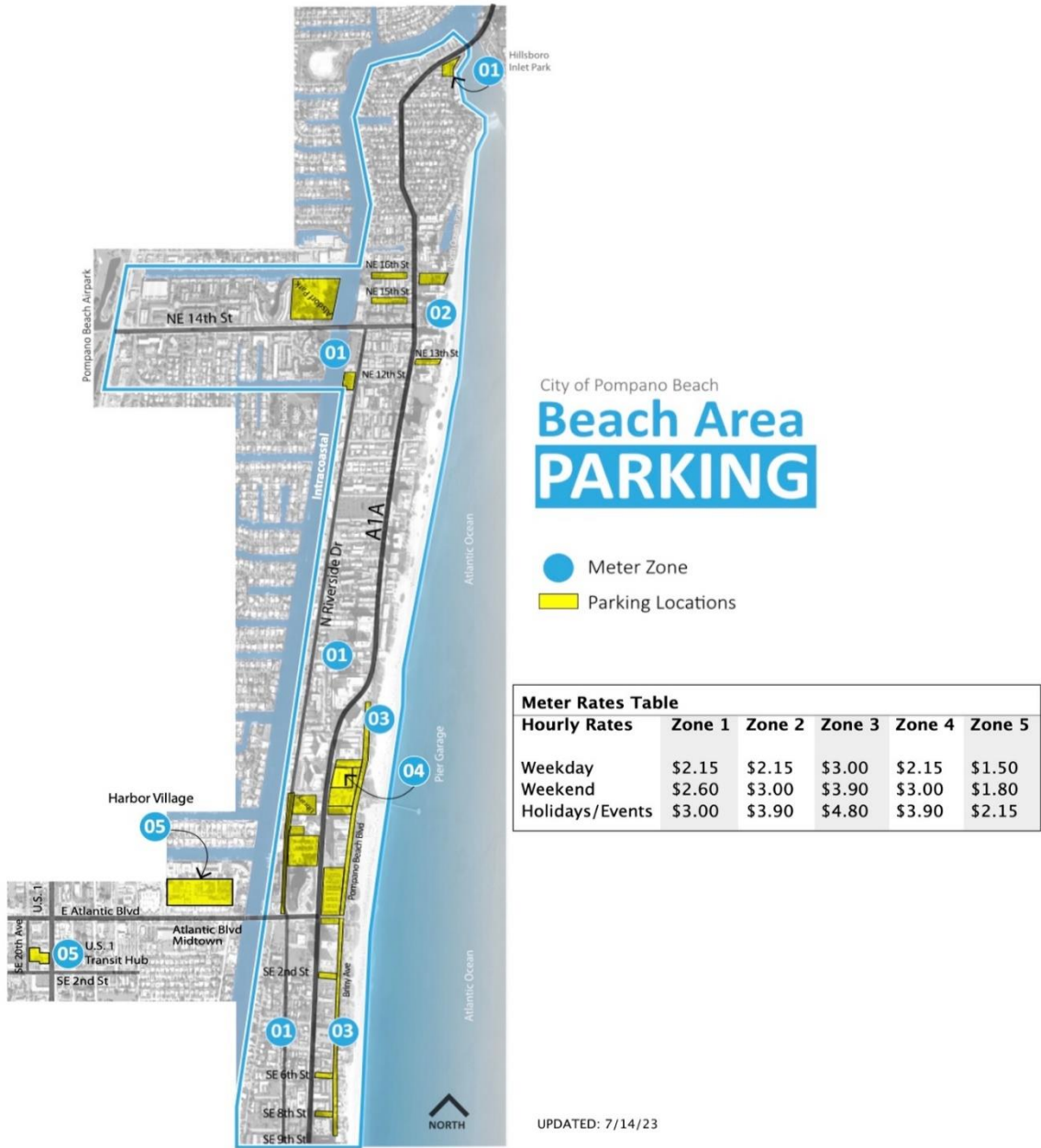
EXHIBIT B PARKING METER ZONE LOCATION MAP