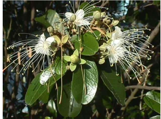
Gumbo Limbo, Orange Geiger, Jamaican Caper