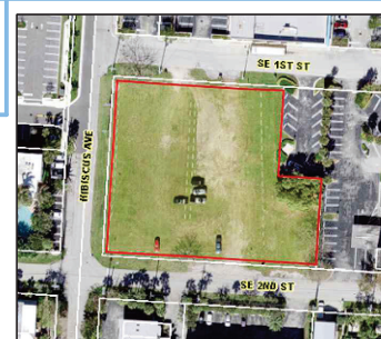
AERIAL PHOTOGRAPH (MAY NOT SHOW LATEST IMPROVEMENTS) (NOT-TO-SCALE)

LEGAL DESCRIPTION: LOTS 5, 6, 7, 8 & 9, LESS THE SOUTH 5 FEET THEREOF, ALSO LESS THE WEST 5 FEET OF LOT 9, TOGETHER WITH LOTS 10, 11, 12 AND 13, LESS THE NORTH 5 FEET THEREOF, AND ALSO LESS THE WEST 5 FEET OF LOT 10, ALL IN BLOCK 8, POMPANO BEACH BLOUNT BROS. REALTY CO.'S SUBDIVISION, ACCORDING TO THE PLAT THEREOF RECORDED IN PLAT BOOK 2, PAGE 43, OF THE PUBLIC RECORDS OF BROWARD COUNTY FLORIDA.