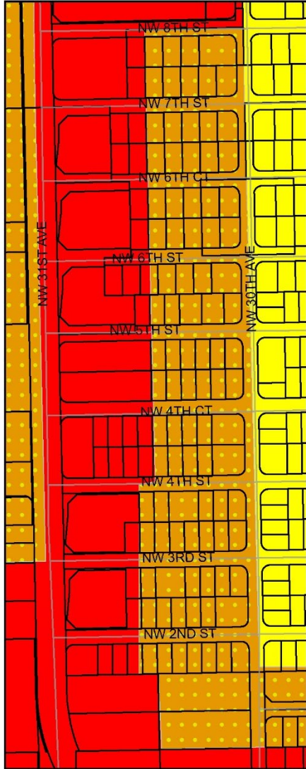
Current Broward County Land Use Plan