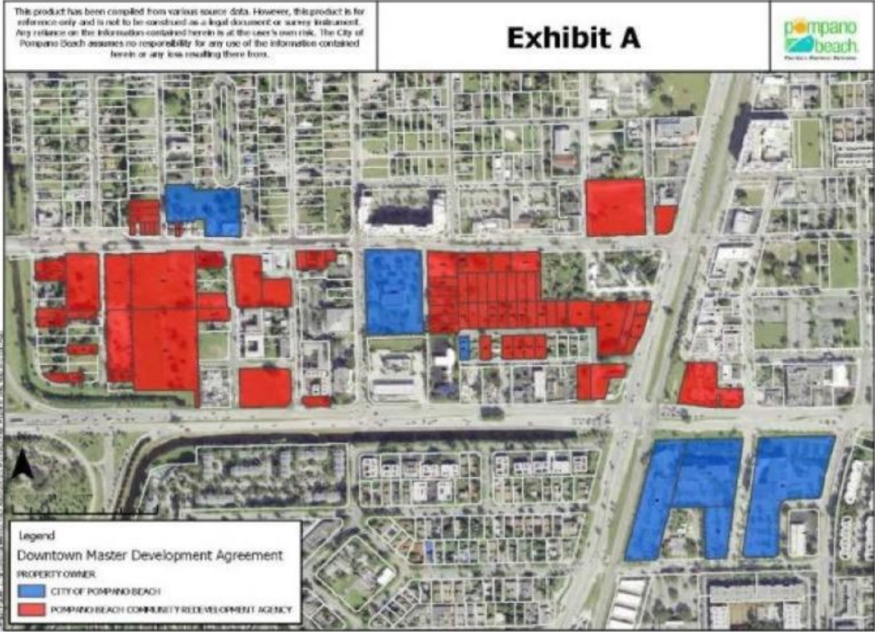
EXHIBIT A PROPERTY