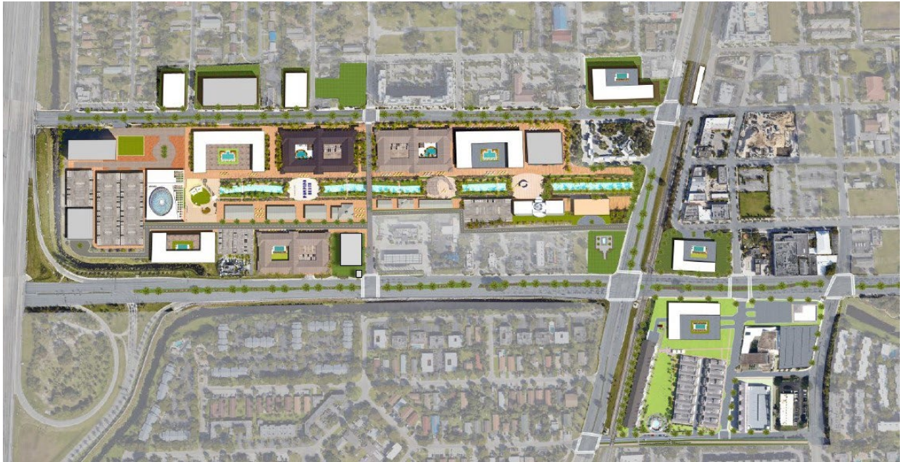
EXHIBIT B-2 MASTER PLAN CONCEPT