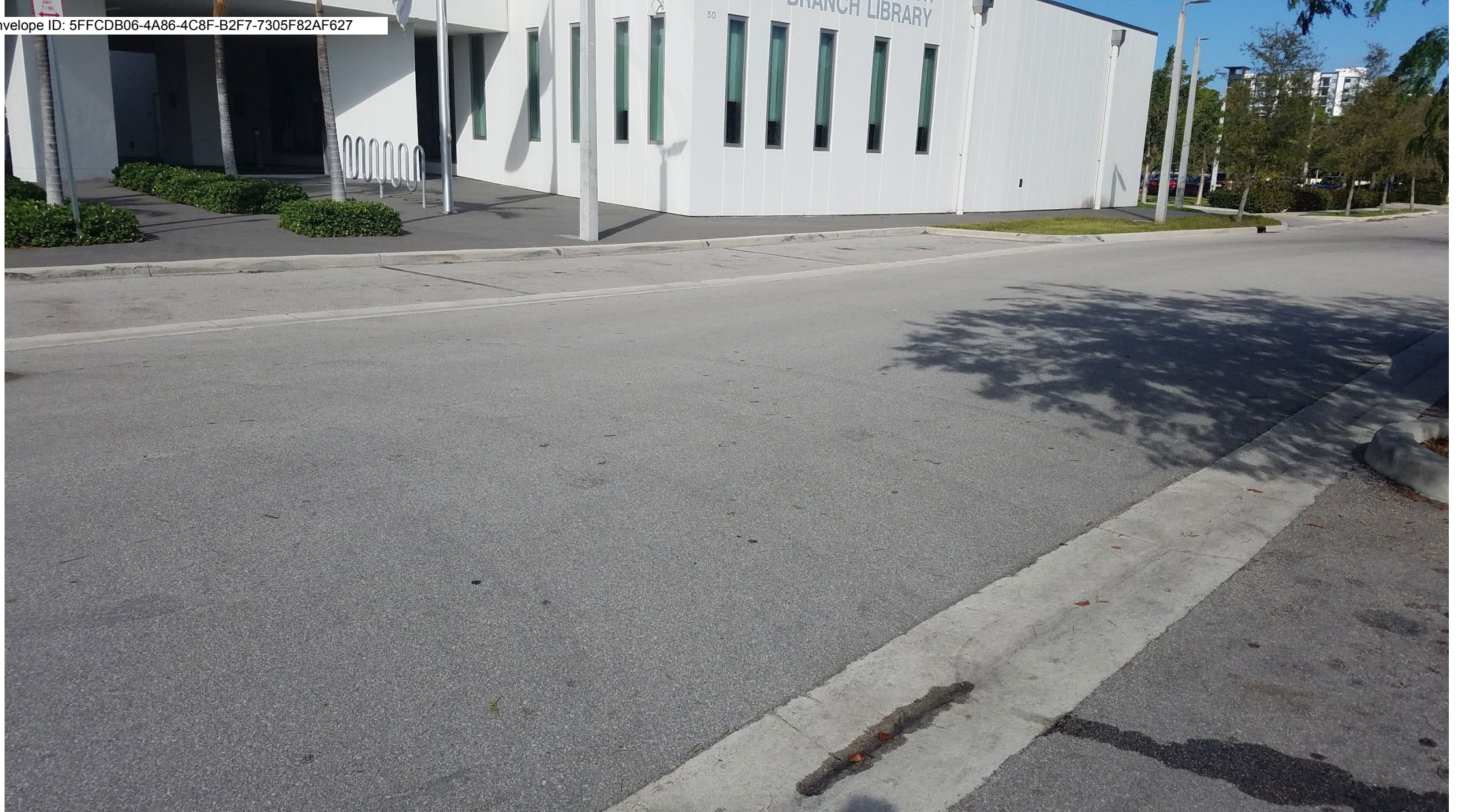
Location 1: on SE 1st Court, measures 24' from cement "gutter" to cement gutter. Creating a 24' square.