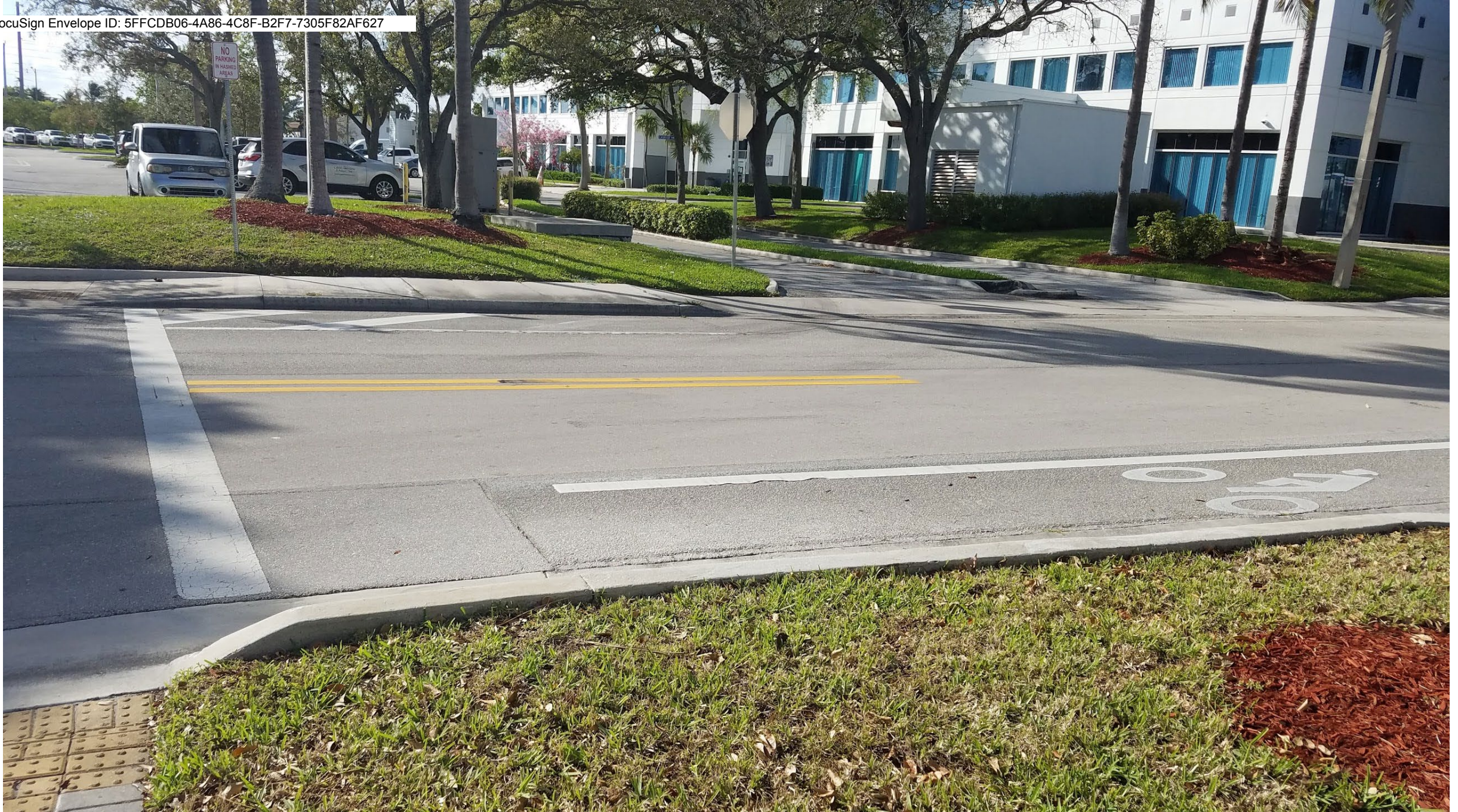
Location 3: 19.6'. 3 would start just 5 or 6 feet north of the crosswalk.