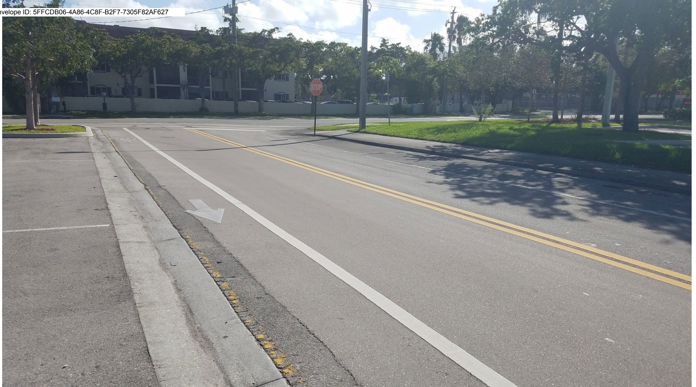
Location 2: Starting from the south on SW 1st Ave, measures 19.66' from white line on the west side of the street, to the white line marking the edge of the bike lane. Art starts estimated 70' north of the crosswalk.