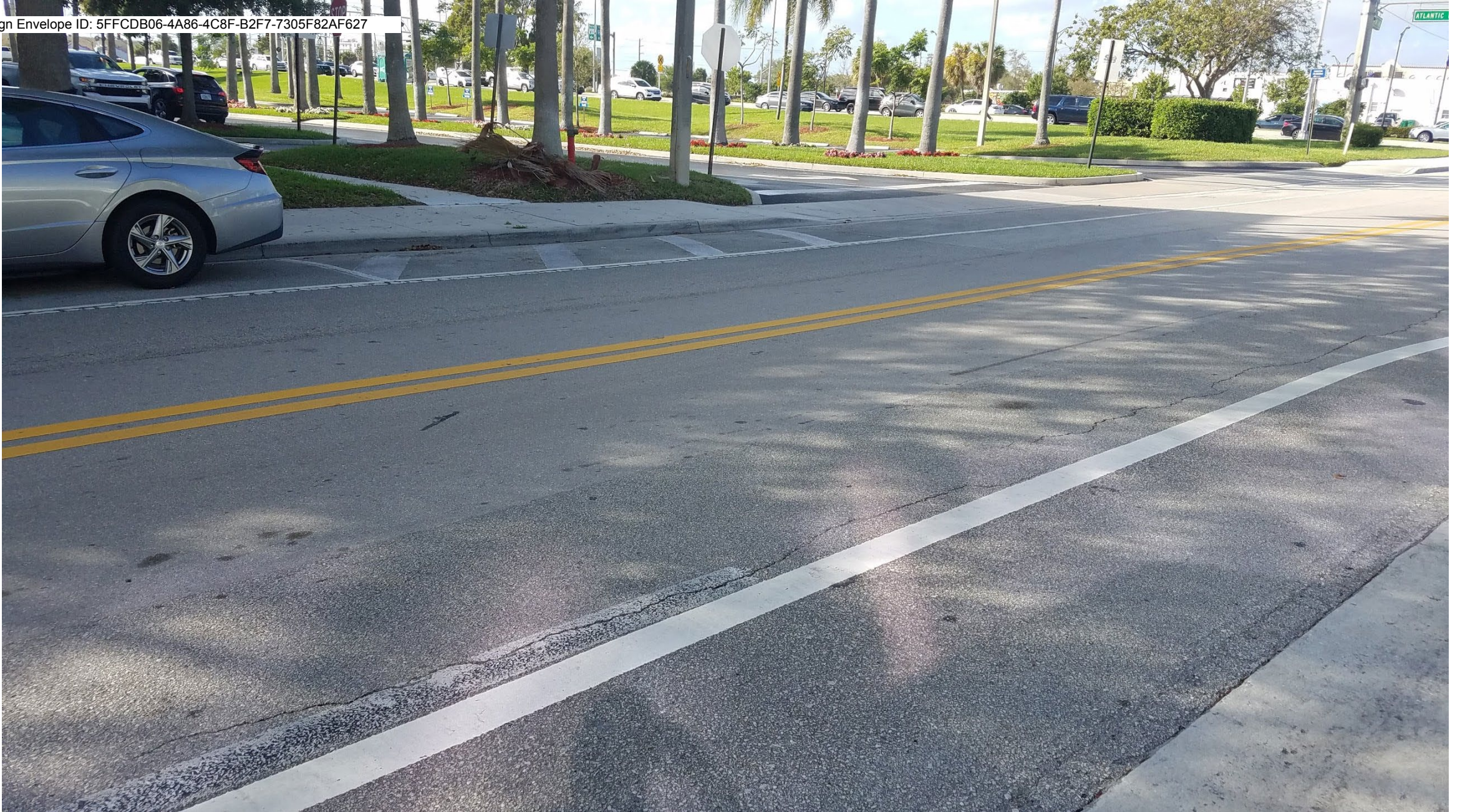
Location 4: should match 2 and 3; 19.6' from the white line on the west side of the street, to the edge of the bike lane white line.