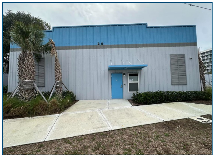
PROPERTY FRONT VIEW