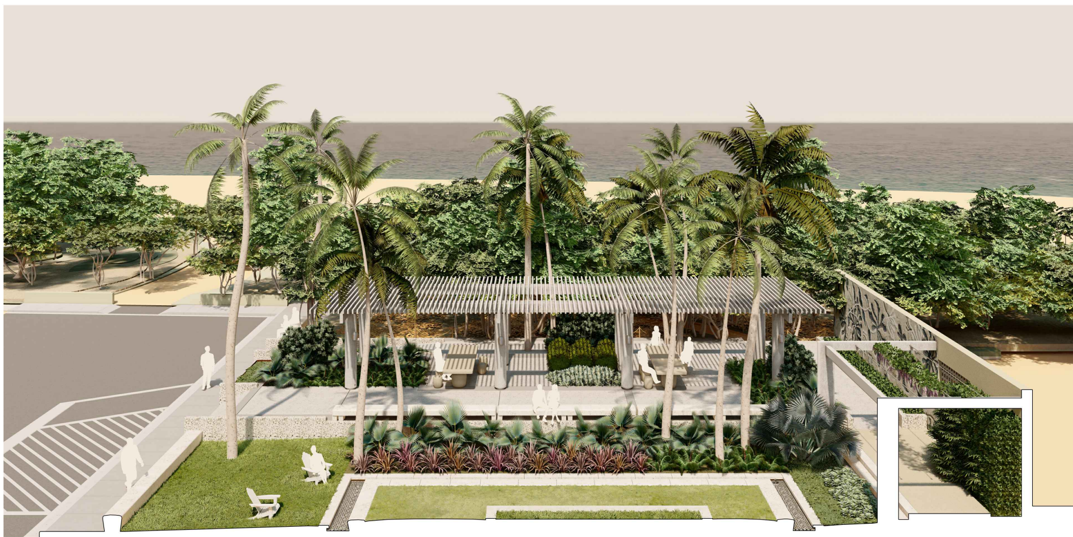
2 CANOPY EDGE 104-L-104 NTS