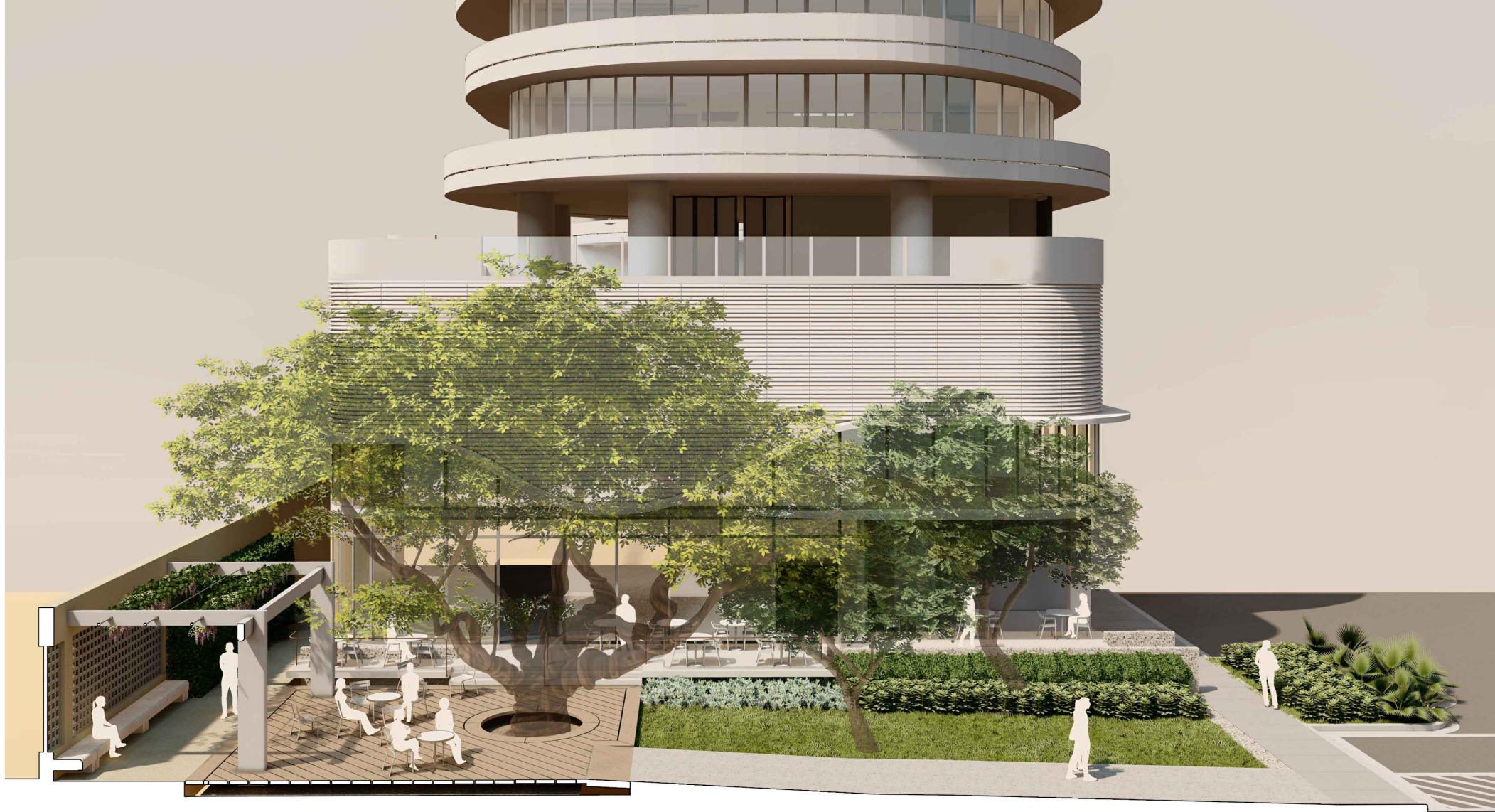
4 BUILDING EDGE 104-L-104 NTS