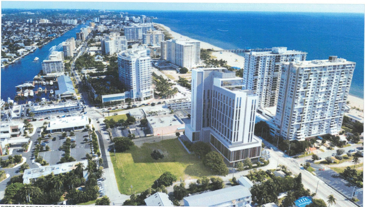
BIRDS EYE RENDERING FROM SOUTH WEST