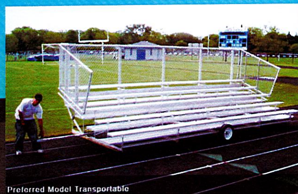
Preferred Model Transportable