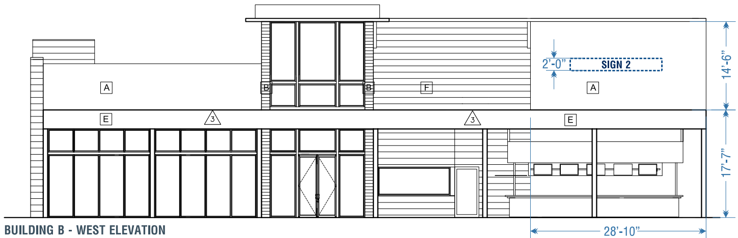
BUILDING B - WEST ELEVATION