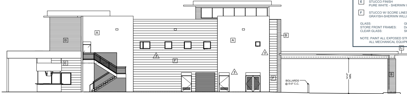
BUILDING "B" - SOUTH ELEVATION

NOTE: PAINT ALL EXPOSED STRUCTURE CHARCOAL BLACK. ALL MECHANICAL EQUIPMENT WILL BE HIDDEN FROM VIEW