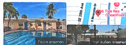
Bahama Beach Club Pompano 4.8 ★★★★★ 31 Google-Rezensionen ! 3-Sterne-Hotel