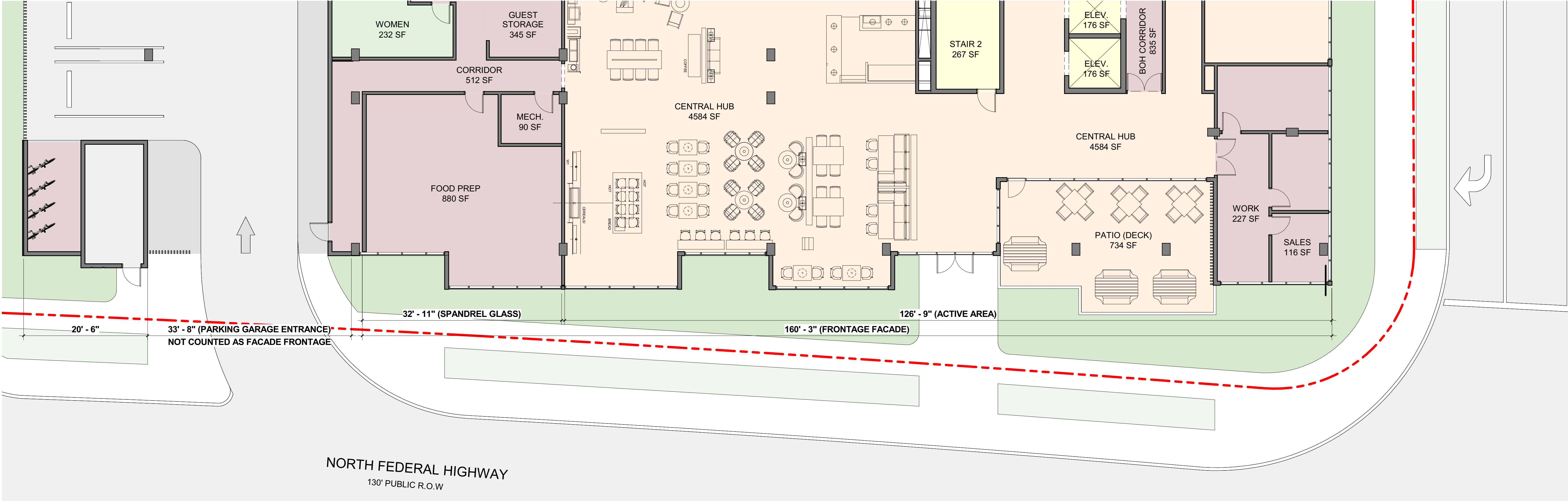
PRIMARY STREET ② LEVEL 1 - FLOOR PLAN, ENLARGED 1/8" = 1'-0"