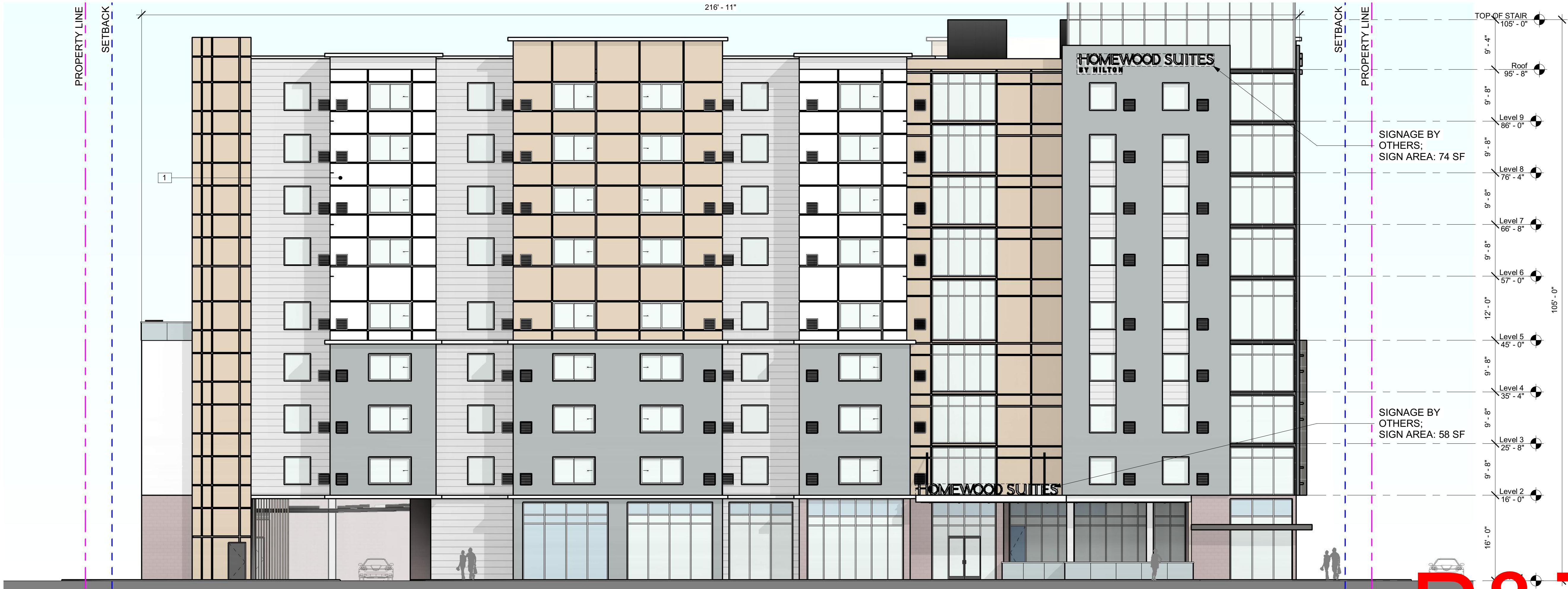
② EAST ELEVATION 3/32" = 1'-0"