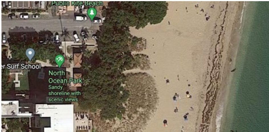
Exhibit A Scope of Authorization Living Water Surf School LLC