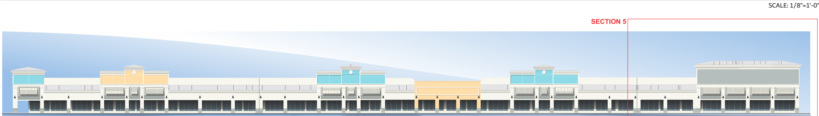
Palm Plaza Elevation

Note: The elevations shown depict "typical" examples of tenant signage, placements and storefront lengths to help guide tenants with detailed information on message sizes and placement on the tenants elevation. The examples of tenant storefront elevation measurements shown in this MSP may change depending on tenant needs and availability of leasing requirements. Final Leased lengths will determine an adjusted allowable square footage calculations for tenant signage per City of Pompano Beach Sign Code