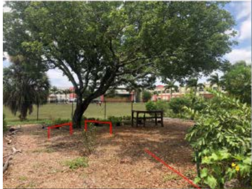
2 Benches will be located under the tree in the image below.