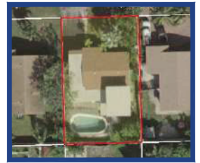
AERIAL PHOTOGRAPH (NOT-TO-SCALE)