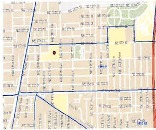
Pompano Middle School 310 NE 6 Street, Pompano Beach, FL 33060