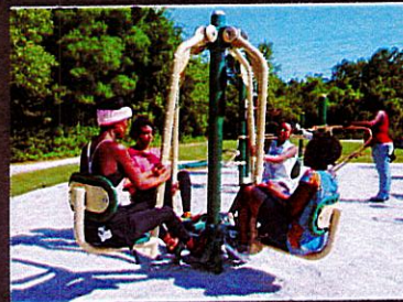
Proposed Exercise Equipment