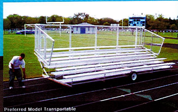
Preferred Model Transportable