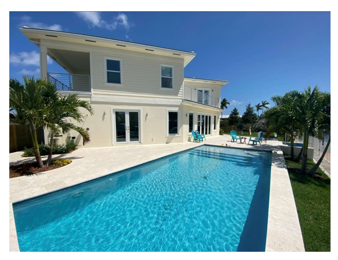
Figure 2LOCATION PERGOLA LOOKING SOUTH

THE BLUE PATIO CHAIRS ARE LOCATED WHERE THE PROPOSED PERGOLA WOULD BE LOCATED.