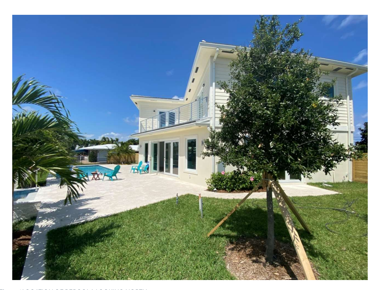
Figure 1LOCATION OF PERGOLA LOOKING NORTH

PLEASE NOTE PITCH OF POOL PATIO, THE PROPOSED ACCERSSORY STRUCTURE COULD NOT BE USED AS HABITAL PART OF RESIDENCE.