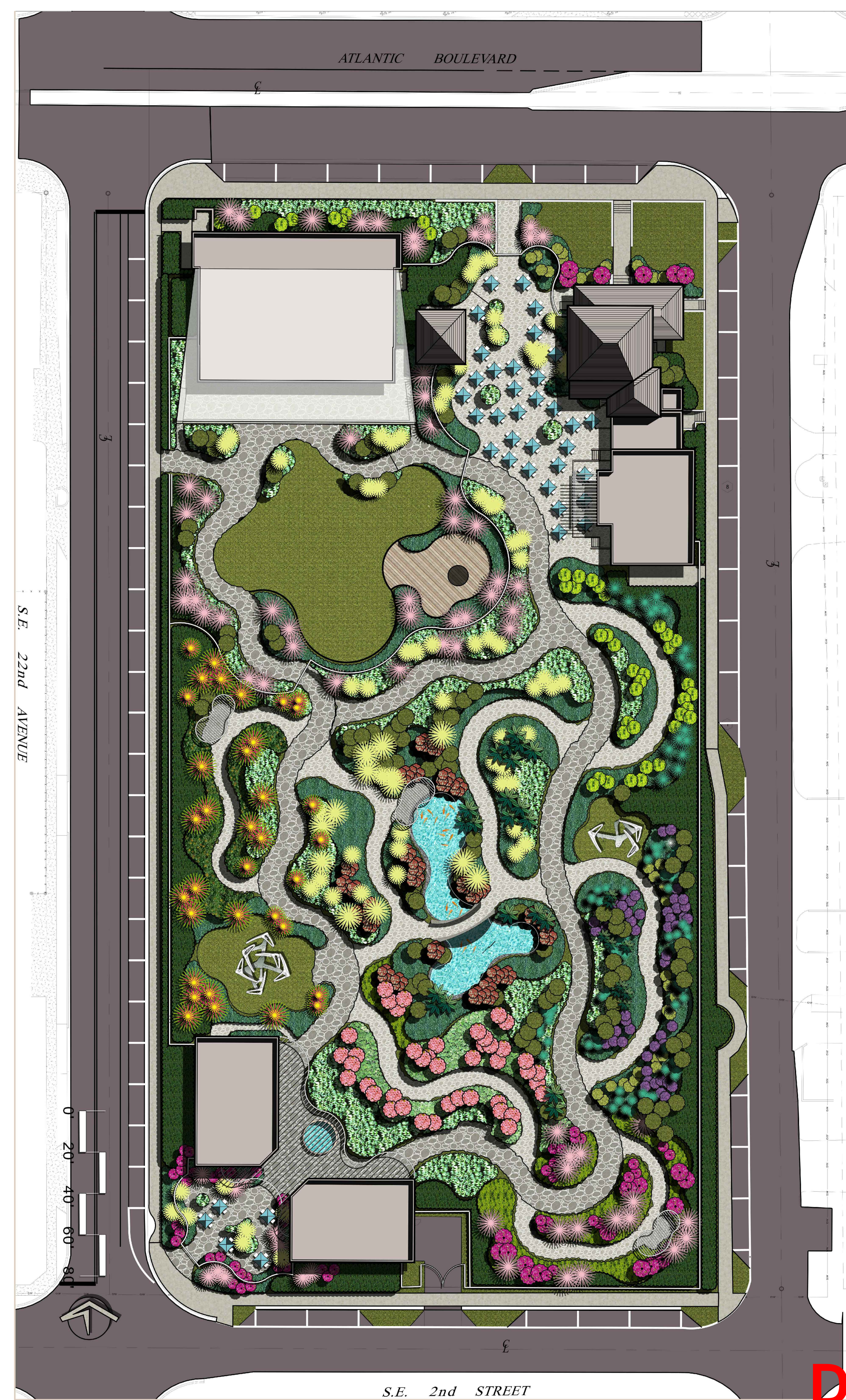
2 ILUSTRATIVE SITE PLAN- NO TREES SP-02 SCALE: N.T.S.