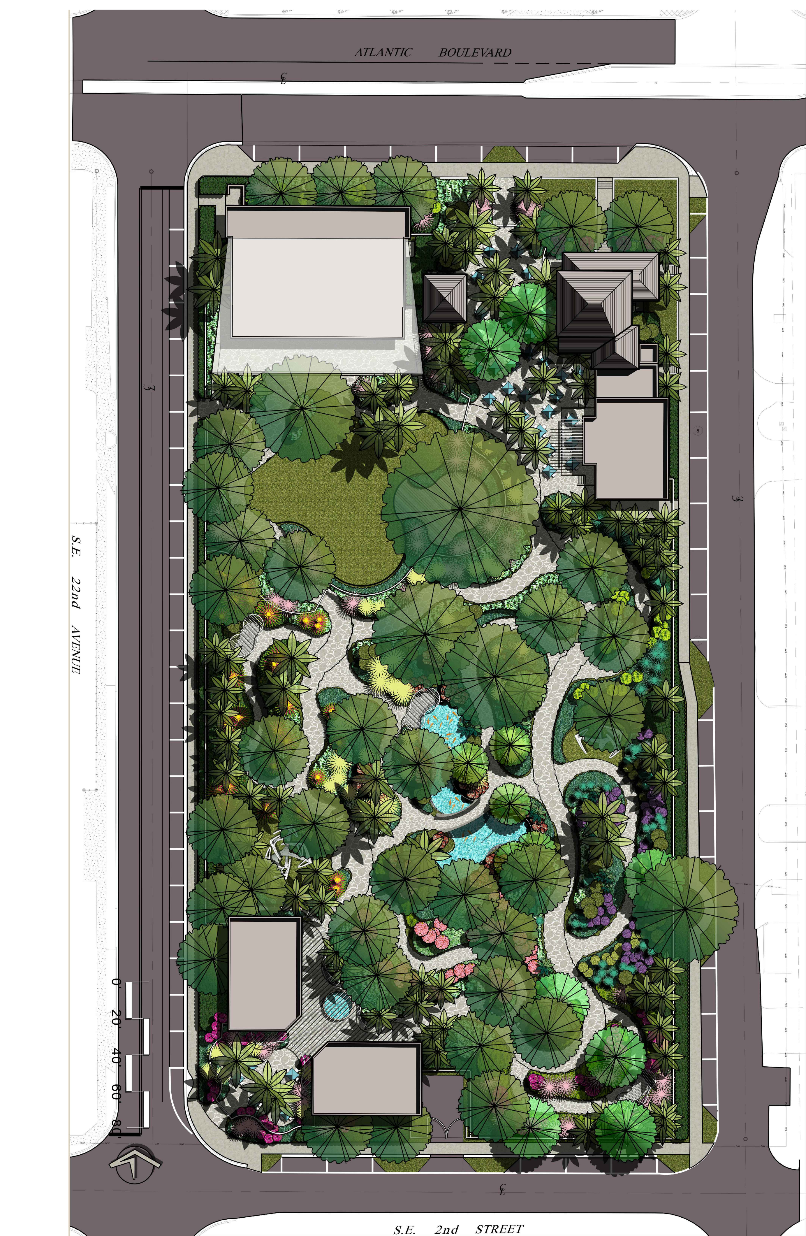
1 ILUSTRATIVE SITE PLAN WITH TREES SP-02 SCALE: N.T.S.