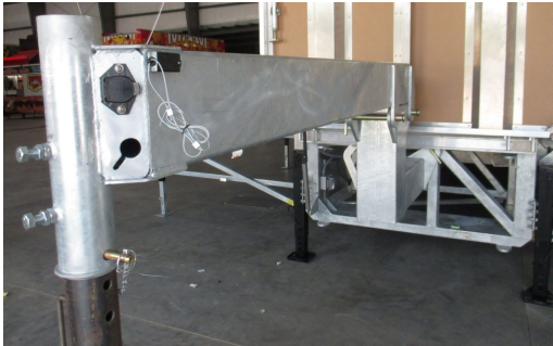
(Optional) Gooseneck 5 th Wheel Shown