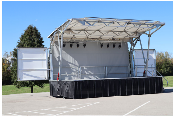
OPEN SIGHT -LINES