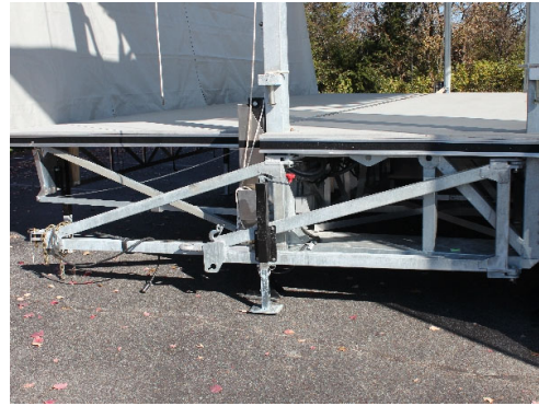
Standard Hitch Shown

During an event the standard bumper pull hitch and a (Optional ) Goose Neck 5 th Wheel can fold into the stage and be hidden away.