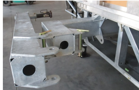
Folded - Gooseneck 5 th Wheel Shown