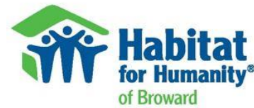
EXHIBIT A- Scope of Work