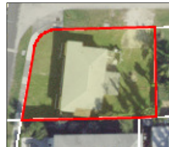
AERIAL PHOTOGRAPH (MAY NOT SHOW LATEST IMPROVEMENTS) (NOT-TO-SCALE)

NONE. RECORD INFORMATION RELIANT UPON ANGULAR DATA ONLY. ALL ANGULAR DATA SHOWN HEREON REFERENCED THERETO.