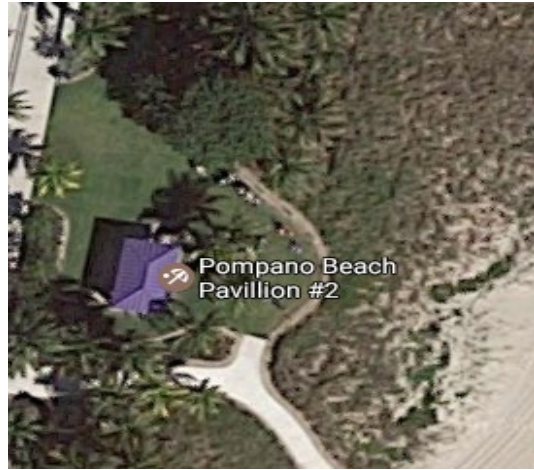
Exhibit A Property Location Map Hola Mundo!, LLC