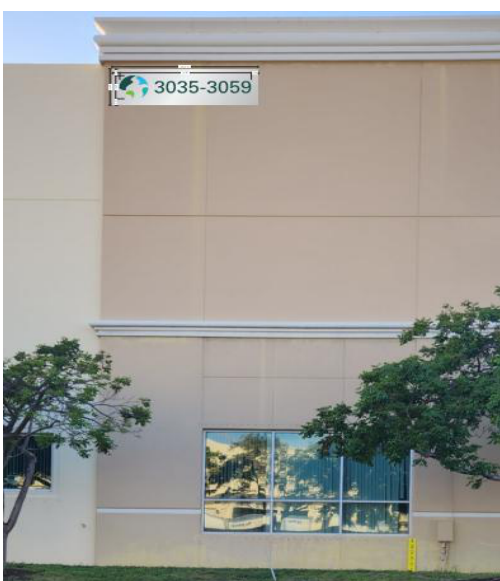
Examples of approved placements shown above