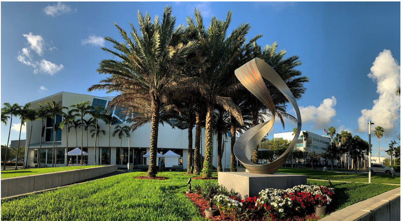
Pompano Beach Cultural Center Current By Michael Szabo Installed 2020.