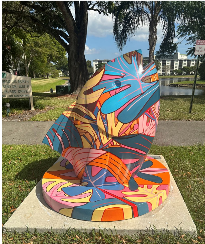
McNair Park Painted Pompano Sculpture: Reaching for the Stars By Darcy Roberts Installed 2023.