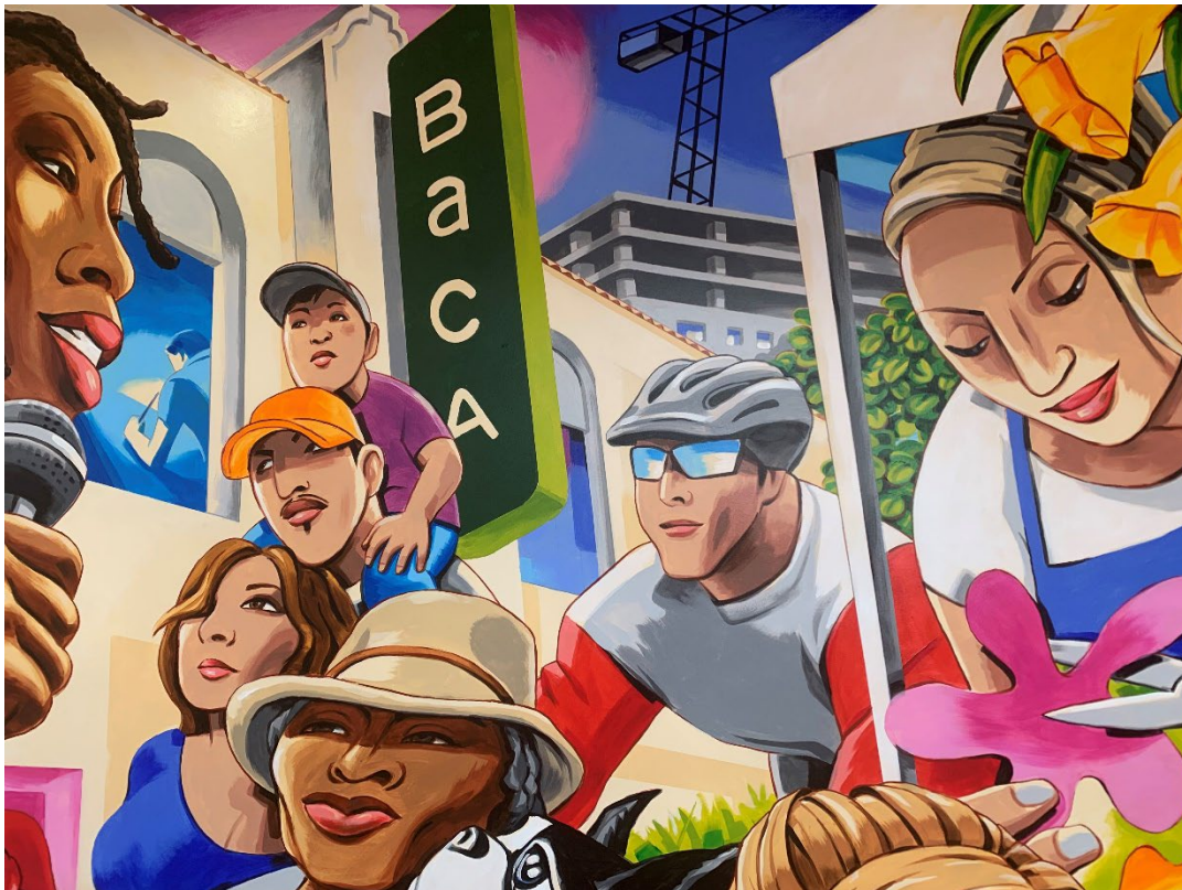
Baily Contemporary Arts (BaCA) Legacy Mural By Andrew Reid SheD Funded by Cultural Affairs Department. Installed 2022.