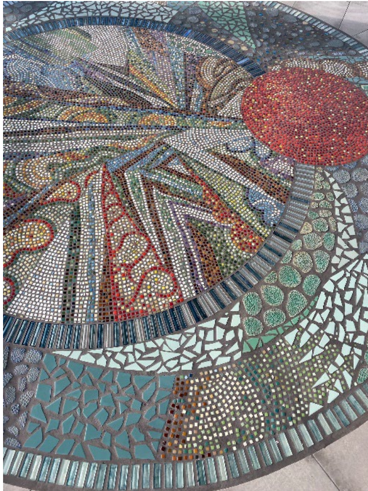
George Brummer Park Decotropolis By Ivette Cabrera Repaint Project Completed 2020.