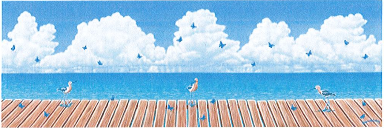
Exhibit 1: Box #1002