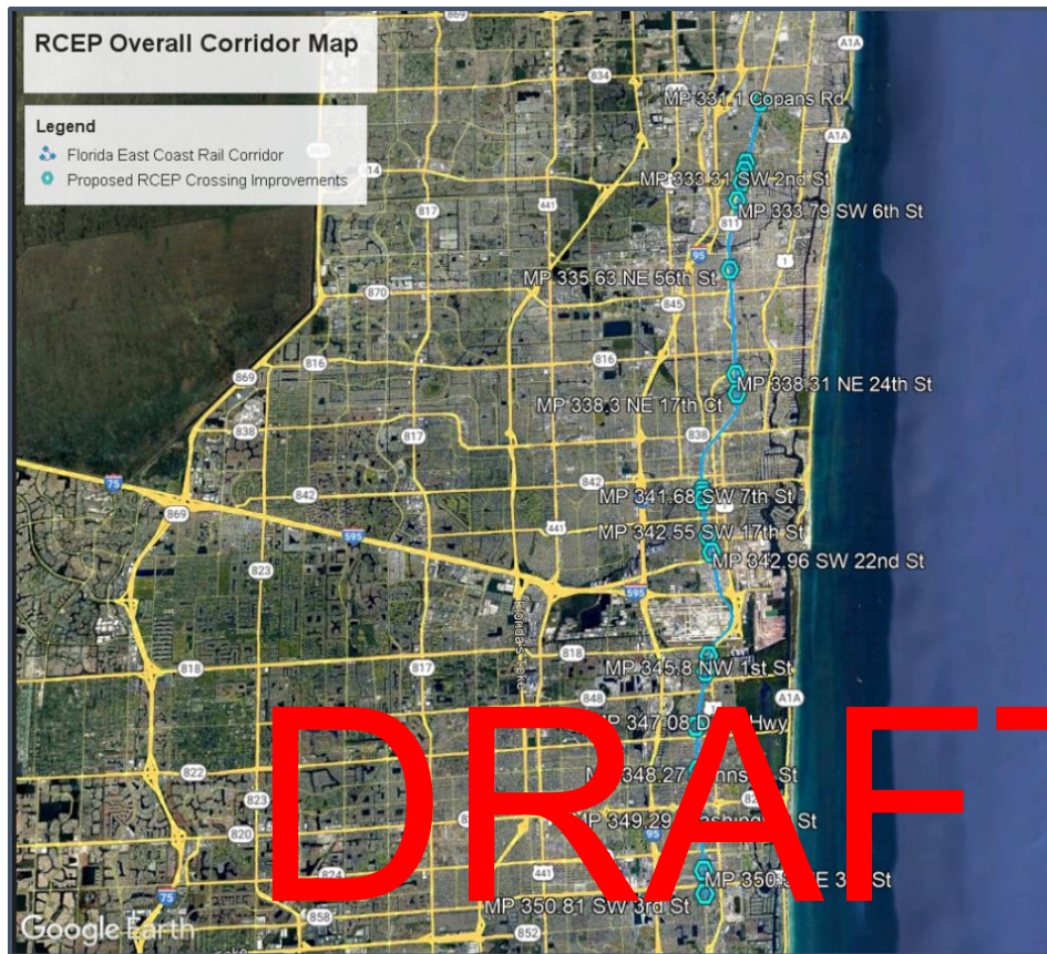
Figure 1 – Project Location Map

NOT INTENDED FOR EXECUTION WITHOUT MODIFICATION