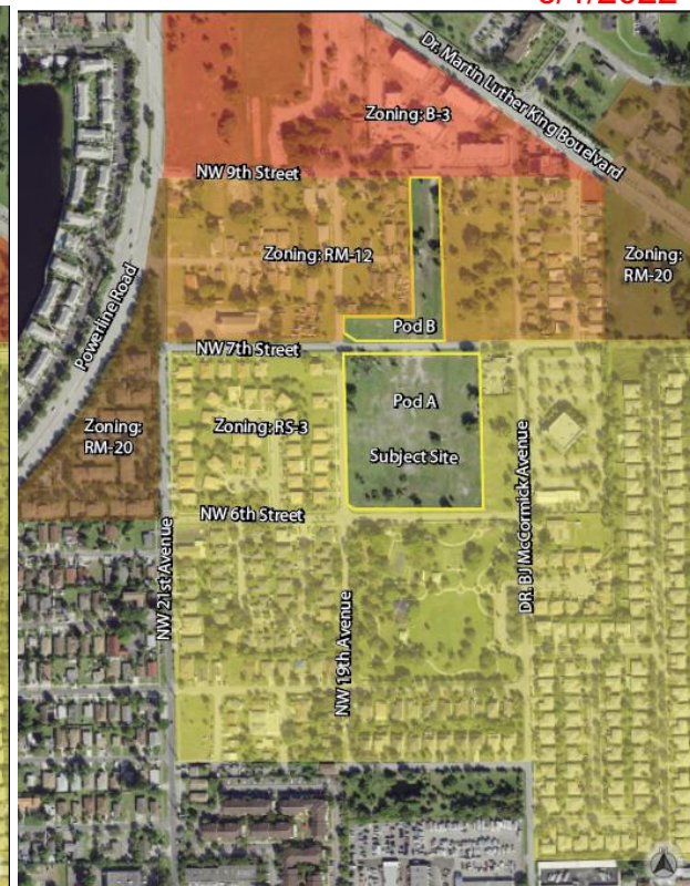
Subject Site – Zoning Map