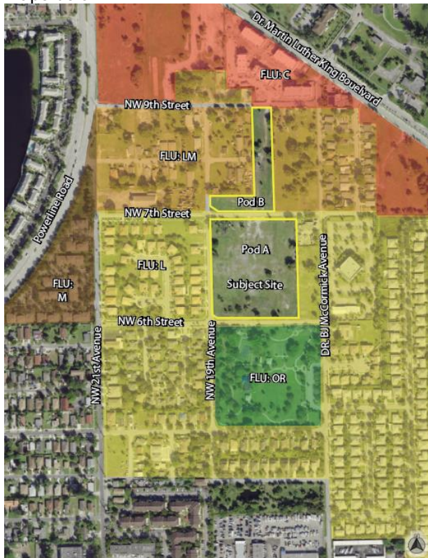
Subject Site – FLU Map

The future land use designations and zoning classifications for the surrounding uses are detailed in the maps below.