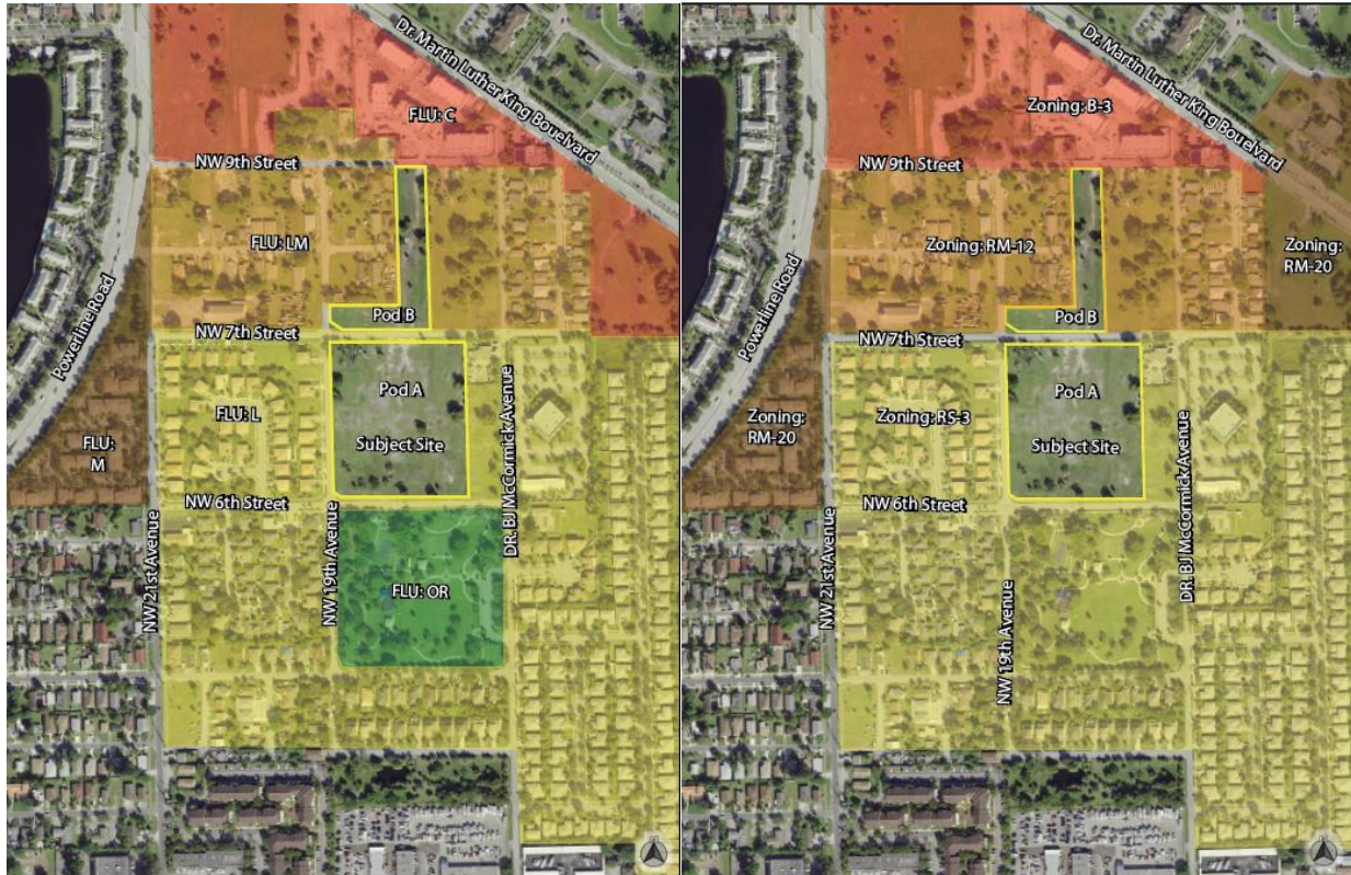
Subject Site – FLU Map