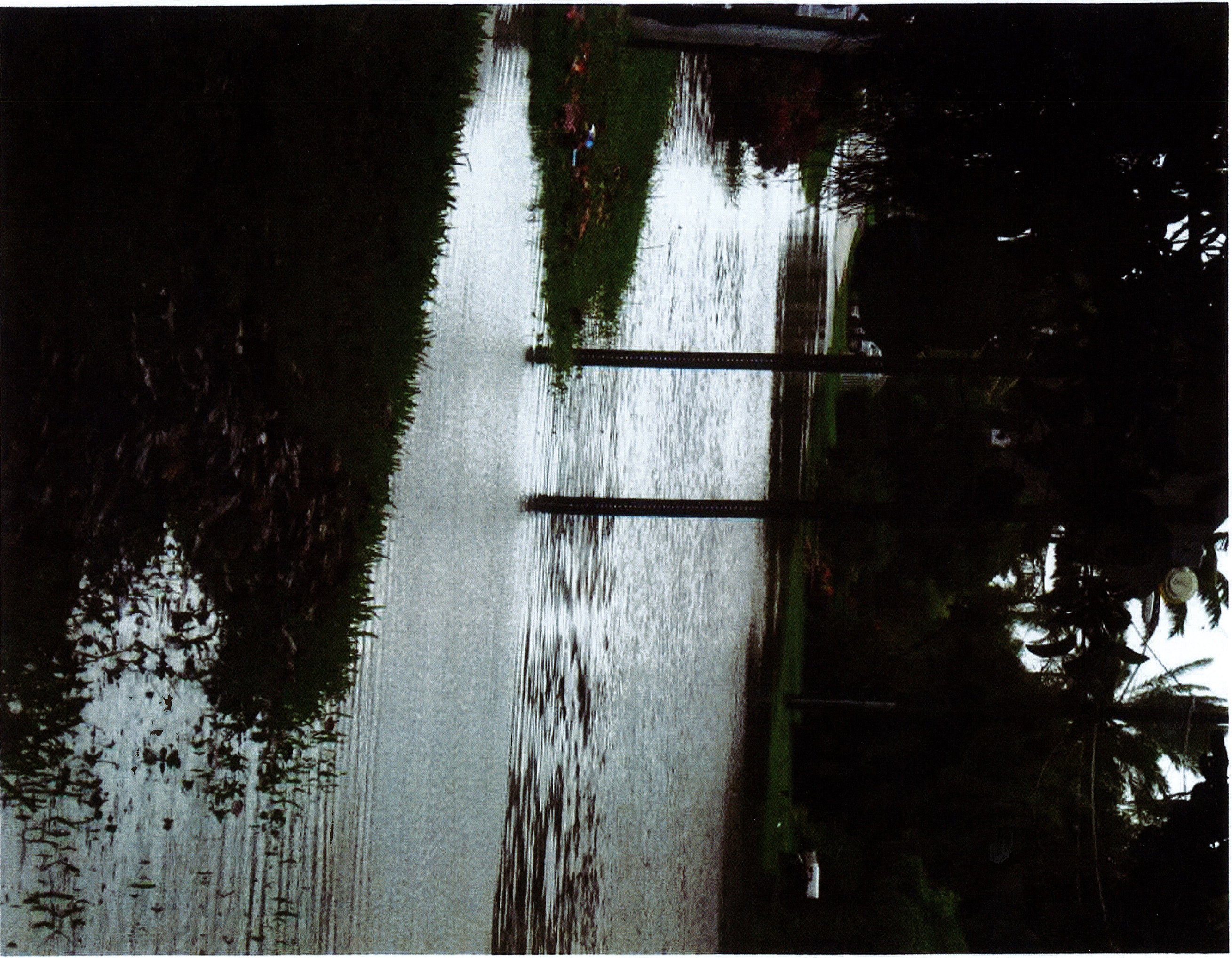
Corner of S Riverside Dr. and SE 2nd St.