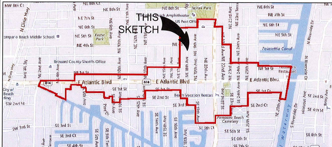
LOCATION MAP: NOT TO SCALE