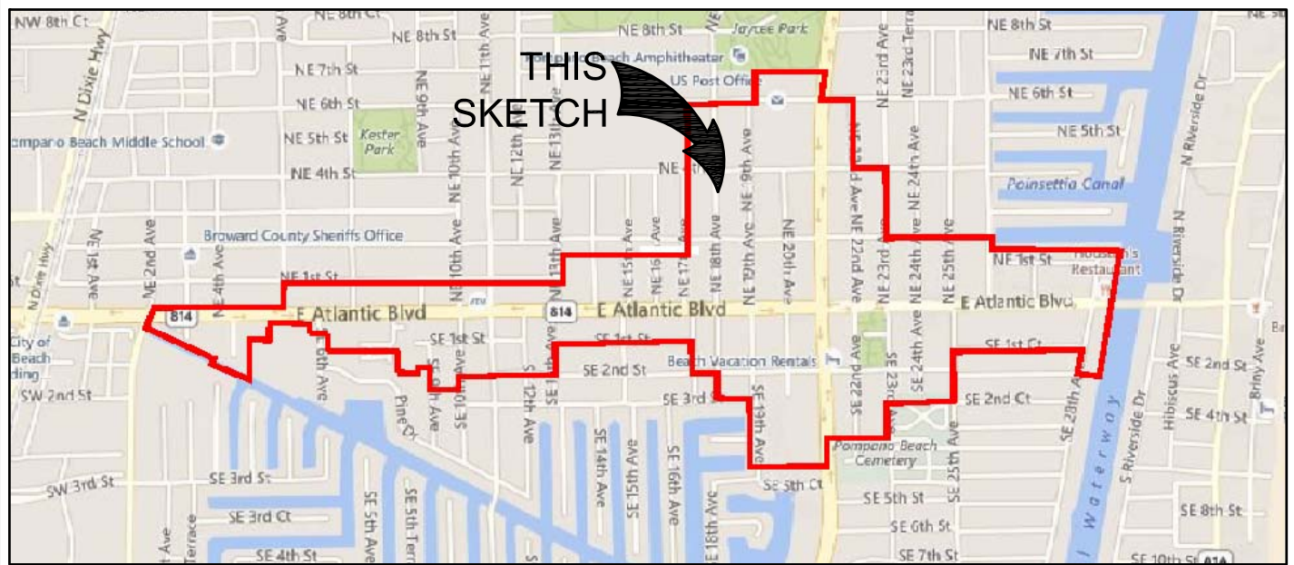
LOCATION MAP: NOT TO SCALE