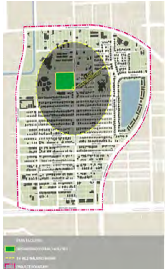
Figure 33: 1-mile Walking Radius from McNair Park.

There is the opportunity to expand the community center building to the north; and the relocation and expansion of the children's play area as well as the inclusion of a tennis court and reconfigured basketball courts; as expressed by the Director of McNair and staff. To be able to accomplish this, the site must be expanded. The parcel immediately to the north and on NW 27th Avenue will need to be acquired and incorporated into the park to provide the required additional land area. Presently a small convenience store is located on the site to the north.